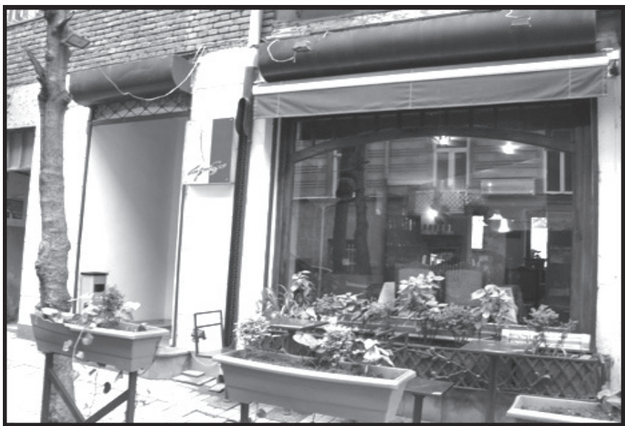
Café Rotonda already in Tbilisi!